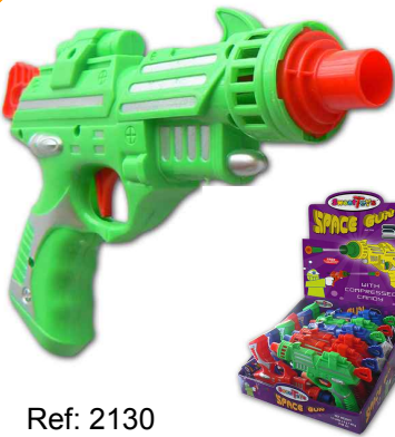
SPACE GUN 3