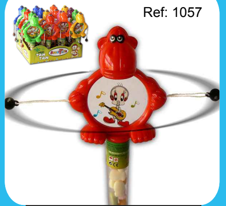
MINI TAM TAM