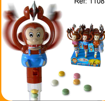
MUSIC MONKEY 2