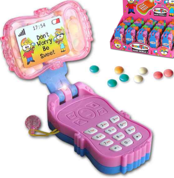
MUSIC MOBILE 2