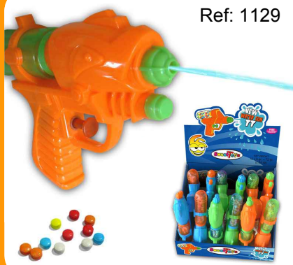
WATER GUN TT