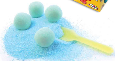
PICA GUMS COLA